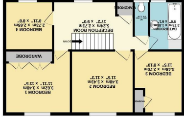
1ST FLOOR: 60.5 sq.m. (651 sq.ft.) approx.

Which energy rating has been made to ensure the accuracy of the figures contained there, measurement of doors, windows, rooms and other areas are approximate and no responsibility is taken for any error or omission on the document. The plan for building purposes only and should not used as such by any prospective purchaser. The architect, systems and appliances shown have not been tested and no guarantee as to their operation or efficacy can be given. Made with Metronx eCO2 TOTAL FLOOR AREA: 143.8 sq.m. (1548 sq.ft.) approx.