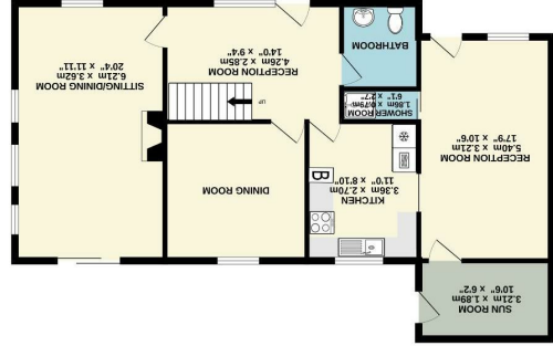
GROUND FLOOR: 83.3 sq.m. (897 sq.ft.) approx.